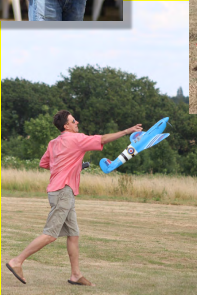
Just a few snaps from the day.