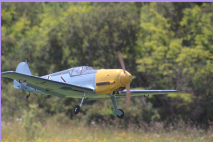
The Black Horse Bf 109 on landing approach, flown by Spiros.