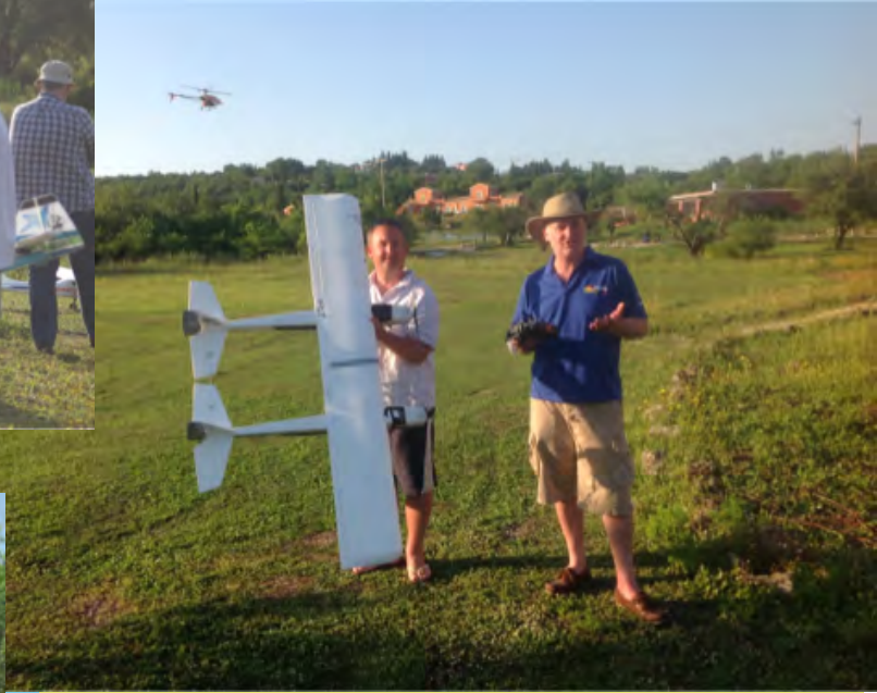
Two Wot 4's joined at the hip, a Wot 8?