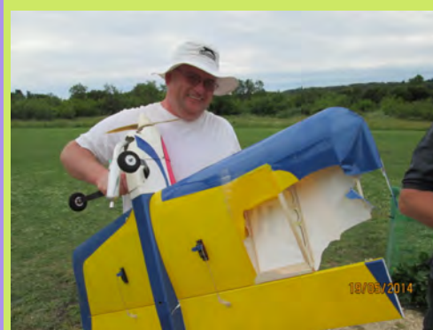
The result of a mid air!