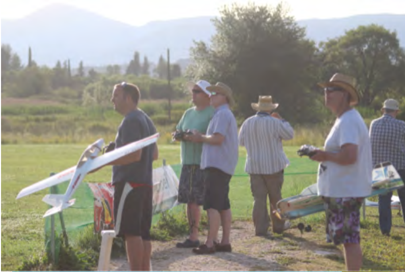
By the dress code, swimming trunks, this is an early evening session. Good sunglasses are essential.