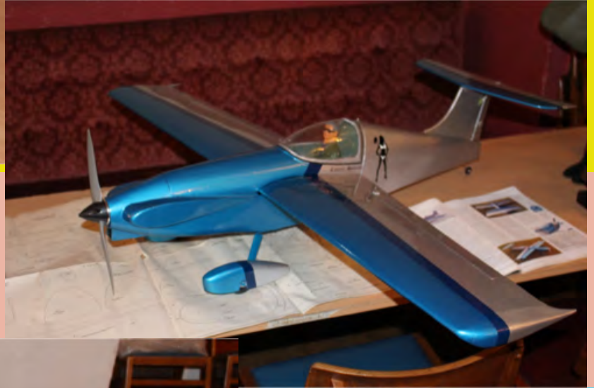
A very pretty Clean Sweep built from a free plan in RCM&E by Roger Woods.