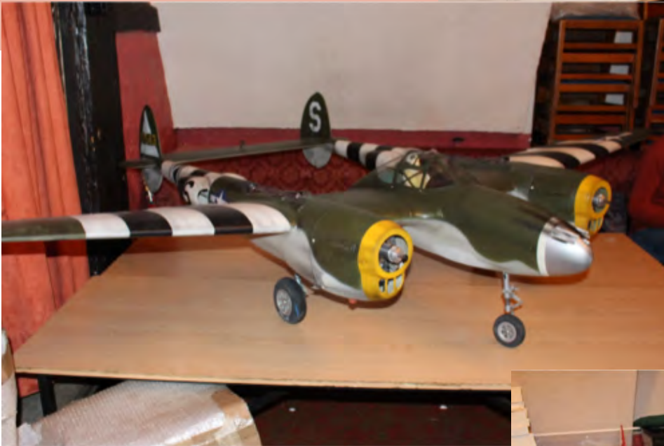
Roger Darvell's P 38 Lightning, powered by two petrol engines.