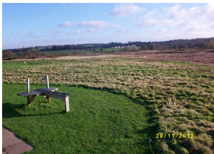
The view to the East of the pits following the recent work with a large machine to clear a large area of brambles. We hope to have this done on a regular basis in future.