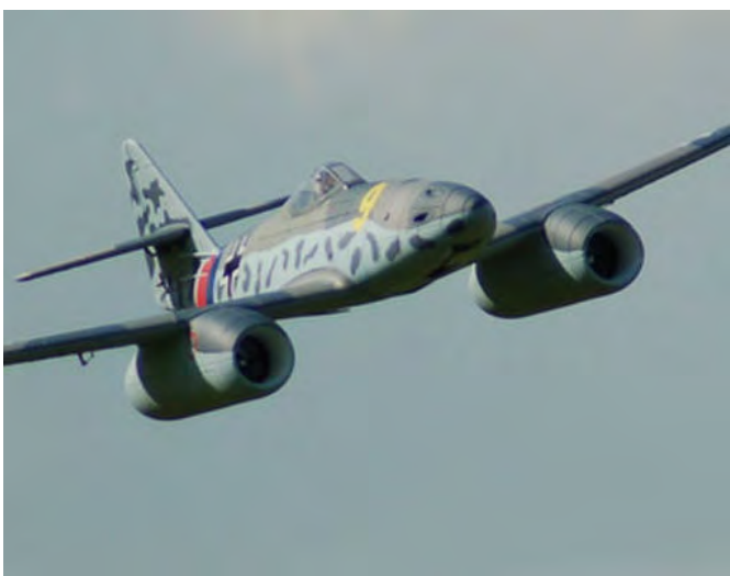
At our last meeting we heard that a number of these ME 262's had been purchased by our members so we may see a flight of them at the field soon.