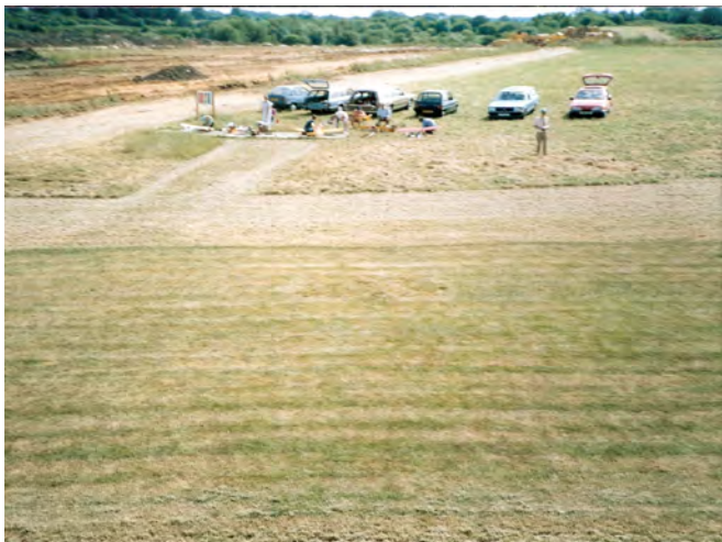
This shot taken in 1987 shows the pits in the initial field layout. More of these vintage pictures can be found on our updated website at www.wlmac.co.uk .